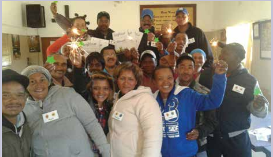
Some of De Kock Boerdery's farm workers who did the BrightStar course