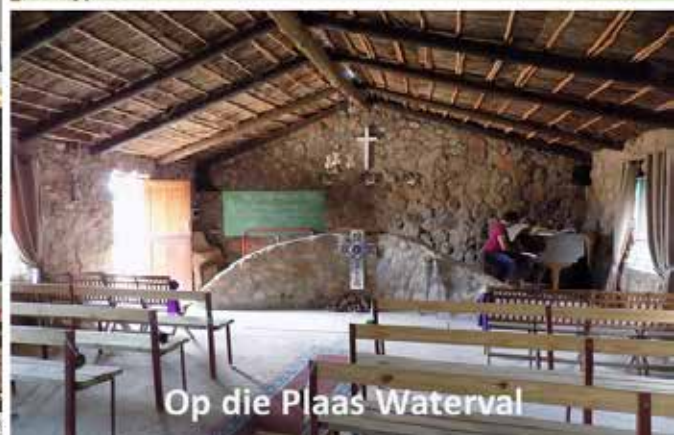
Op die Plaas Waterval